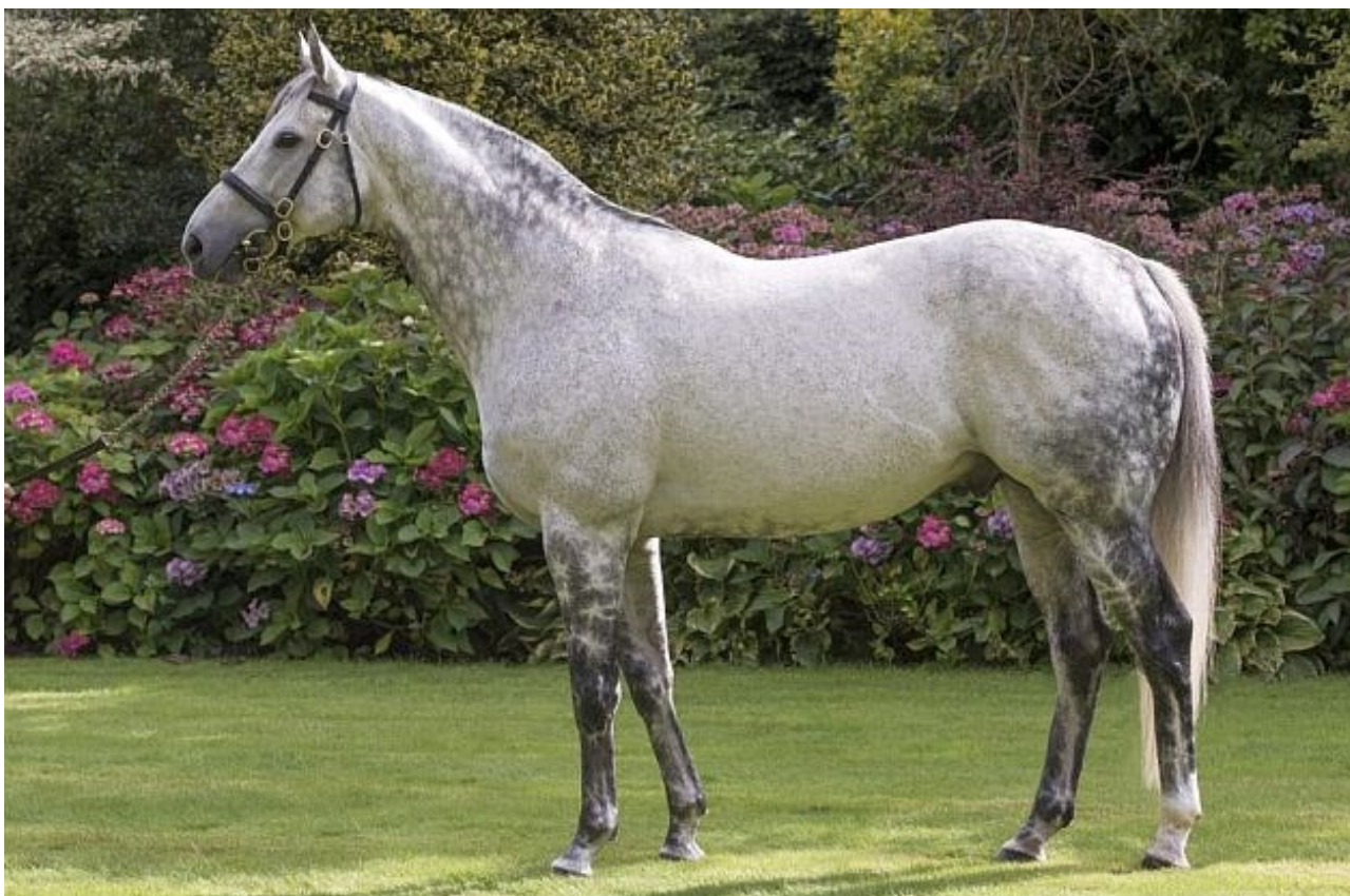
Mastercraftsman, excellent as a sire and broodmare sire.