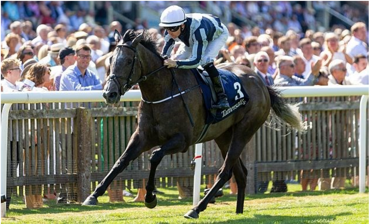
Alpha Centauri by Mastercraftsman, now four times Gr1 winner.