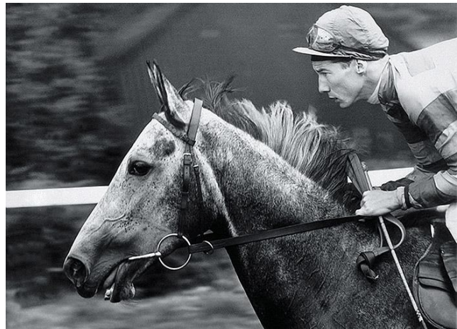
Lester Piggott on Petite Etoile.

A stallion with a wonderful female line is always a candidate for broodmare sire status. If unknown or unrecognised or somehow suffering from a negative prejudice, those genes are not going to get a fair crack of the whip.