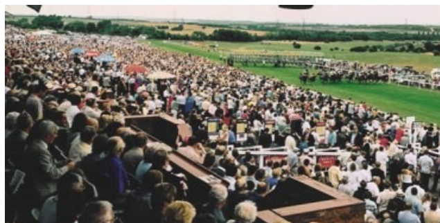
"They're off!" at Pontefract.

When races started, the call was "Off at Haydock" - or wherever - signalling the end of betting on that race. Then silence. Or maybe a show from another racecourse. Everyone was on tenterhooks 6, 12, 18, 24 times every afternoon, sometimes evening. Then "Result Haydock" would come through the loud-speaker, listing the winner and placed horses with their starting prices. If the shop had done well, the rule was "dead straight faces". I got ticked off very early on, showing boyish delight when a horse of which I was a special fan was called as the winner.