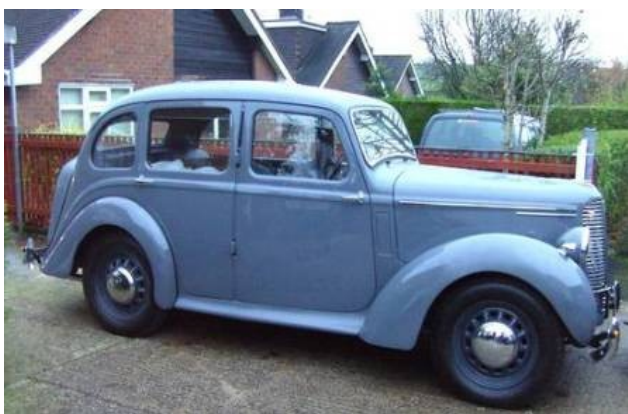
The young "Allanmobile" was a 1948 Hillman 10. The author hastens to add that his was already an old model when he bought it.

How incongruous to consider – in 2017 – that a 26-year-old master and a teenaged one (me) were allowed to take a party of 11-13 year-olds climbing in the Lakes for a week with heavy Easter holidays snow at all heights. Actually that was regarded as completely normal.